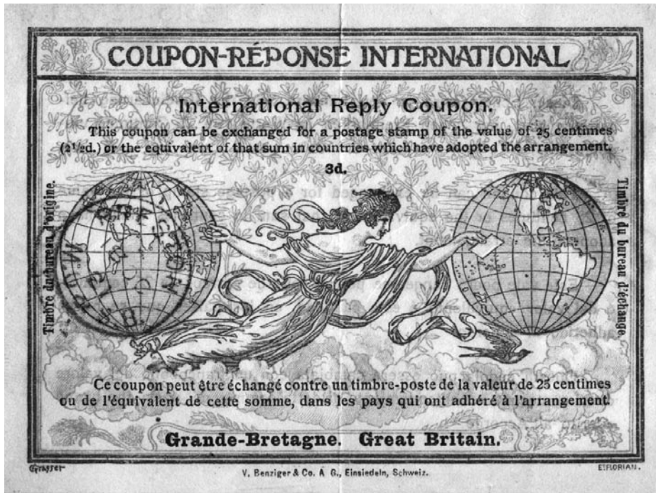
International reply coupons like this formed the basis for Charles Ponzi's money-making scheme.

creative accounting practices without getting caught, and move money around via off balance sheet liabilities and inter-company holdings and raise massive capital by introducing complex hybrid securities.